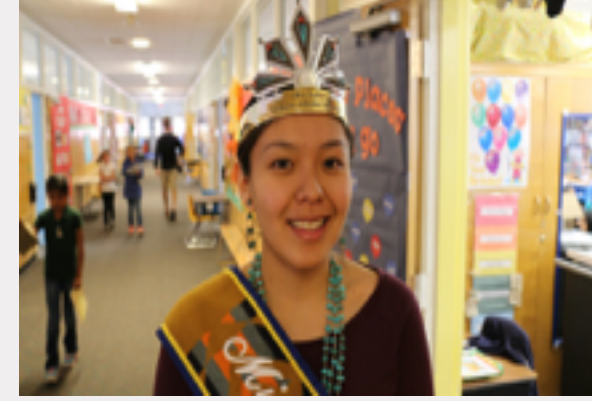
Miss Indian NAU enjoying outreach in elementary schools